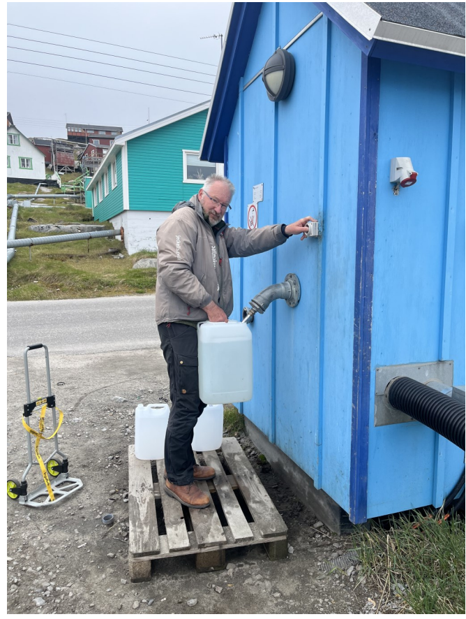
All the settlements have these blue huts where you can get water by pressing the button. They are mainly for the winter if the mains water to your house has frozen but come inhandy for us

enough and the position of some of them made it virtually impossible to tighten with a normal screwdriver, however the socket would do the trick. We also got a couple of extra water barrels to make collecting water easier.