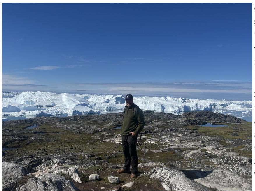
The northern side of the Icefjord, looking even more impressive. The face of the glacier is about 16 miles to the left of the picture and these icebergs are impressive to say the least

did read something about some research to alternatives to diesel in Arctic Canada but I think the conclusion was that it to be some high density liquid fuel that we don't currently have rather than electric.