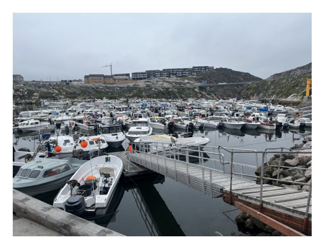
Just a bit congested and not really any space for visiting yachts!

for a space but were greeted with possibly the busiest most crowded place I have ever seen. We tied up to the quay next to a couple of yachts that were in turn rafted to the side of the fishing boat. One of the yachts we had seen several times before, Lady Dana and the Polish skipper thought we would be ok there for the night. However, not wanting to annoy the locals too much and as we were obviously in the place reserved for unloading fish as we were directly