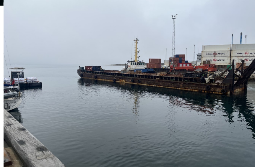
The big barge and tug leaving on a still and misty evening

tainer from further down in the harbour with a small dinghy and outboard so that they were alongside his boat. This was done with a without drama or incident and single handed. Later on I saw the captain of the big tug and barge as they were intending to leave and he was very scathing about the new kid on the block with his small fishing boat and pontoons. I must admit if I was out at sea with the 60m barge and ocean going tug I would prefer that to the small fishing boat with some pontoons the size of shipping containers